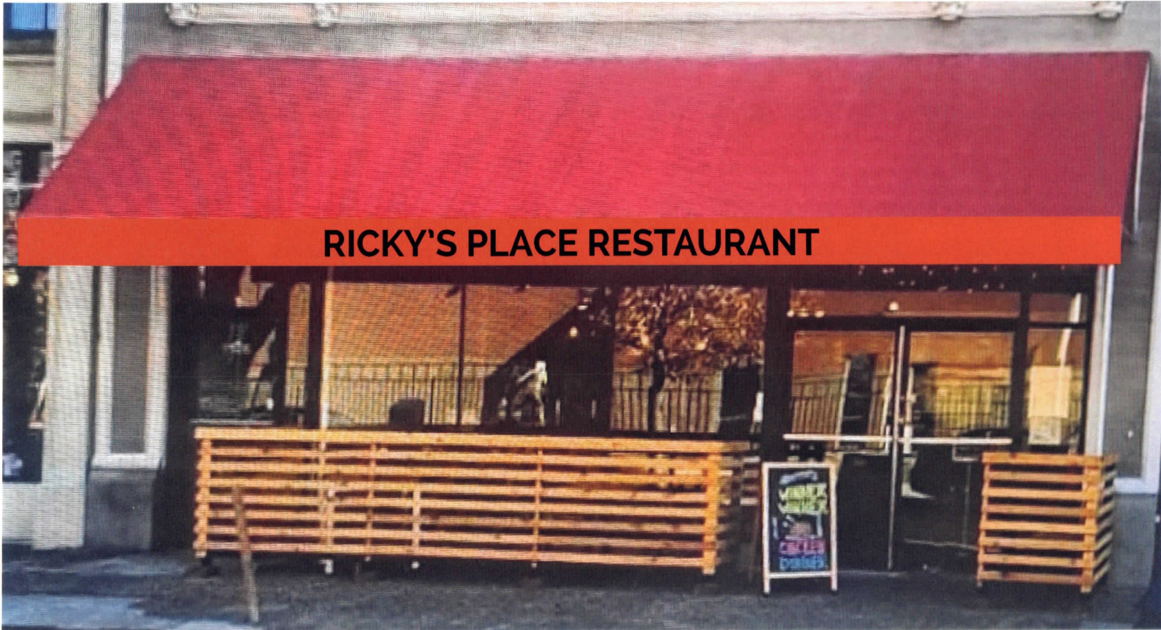
RICKY'S PLACE RESTAURANT